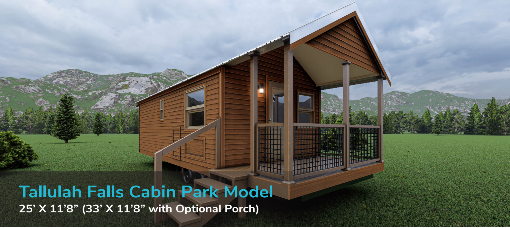
Tallulah Falls Cabin Park Model 25' X 11'8" (33' X 11'8" with Optional Porch)