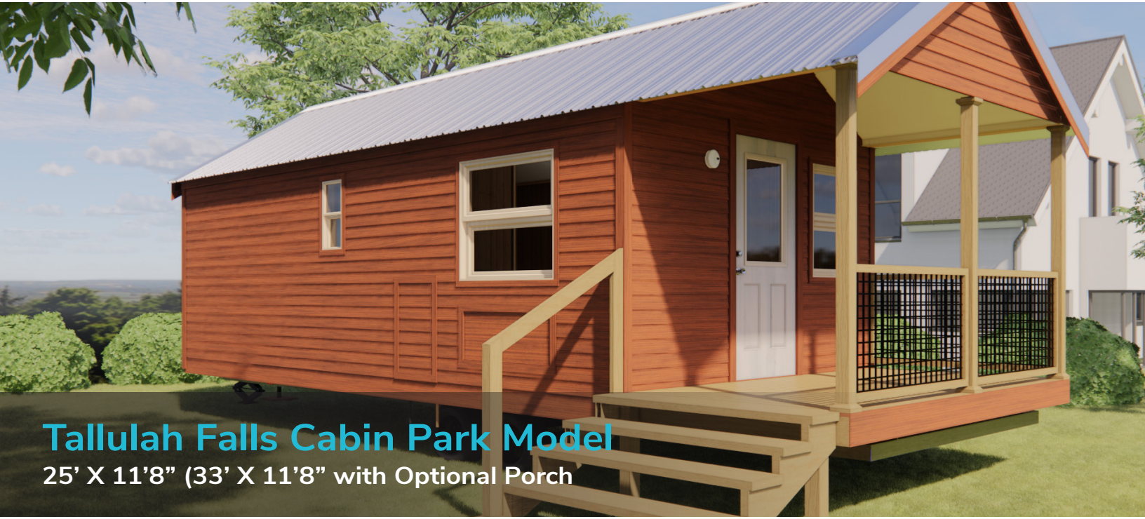
Tallulah Falls Cabin Park Model 25' X 11'8" (33' X 11'8" with Optional Porch)