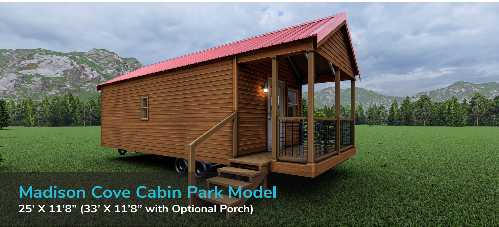
Madison Cove Cabin Park Model 25' X 11'8" (33' X 11'8" with Optional Porch)