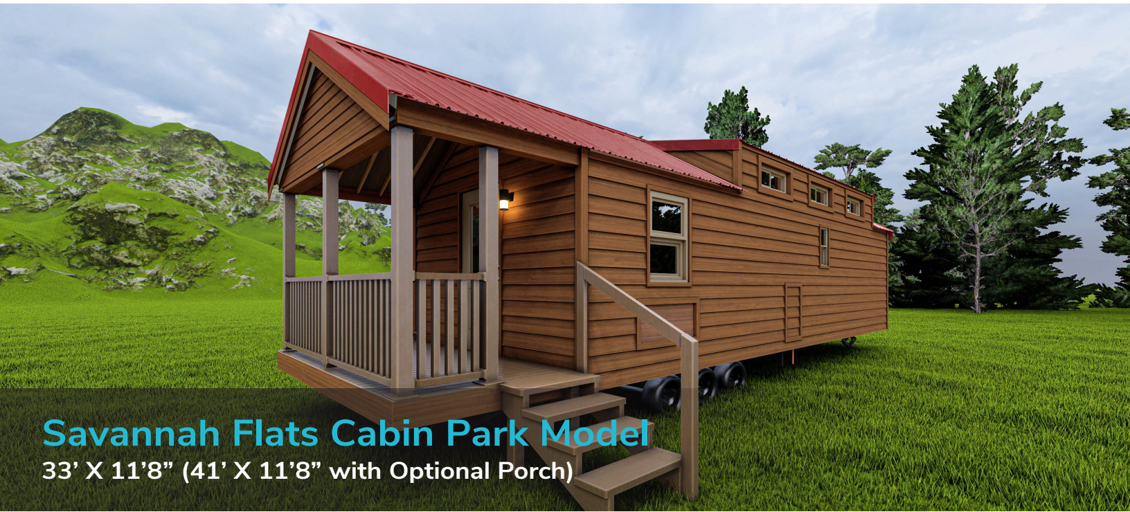
Savannah Flats Cabin Park Model 33' X 11'8" (41' X 11'8" with Optional Porch)