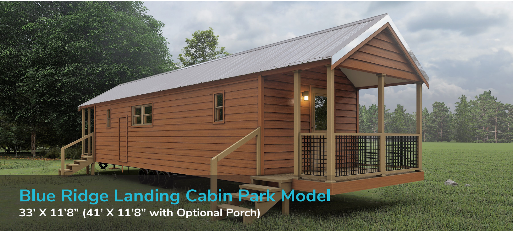
Blue Ridge Landing Cabin Park Model 33' X 11'8" (41' X 11'8" with Optional Porch)