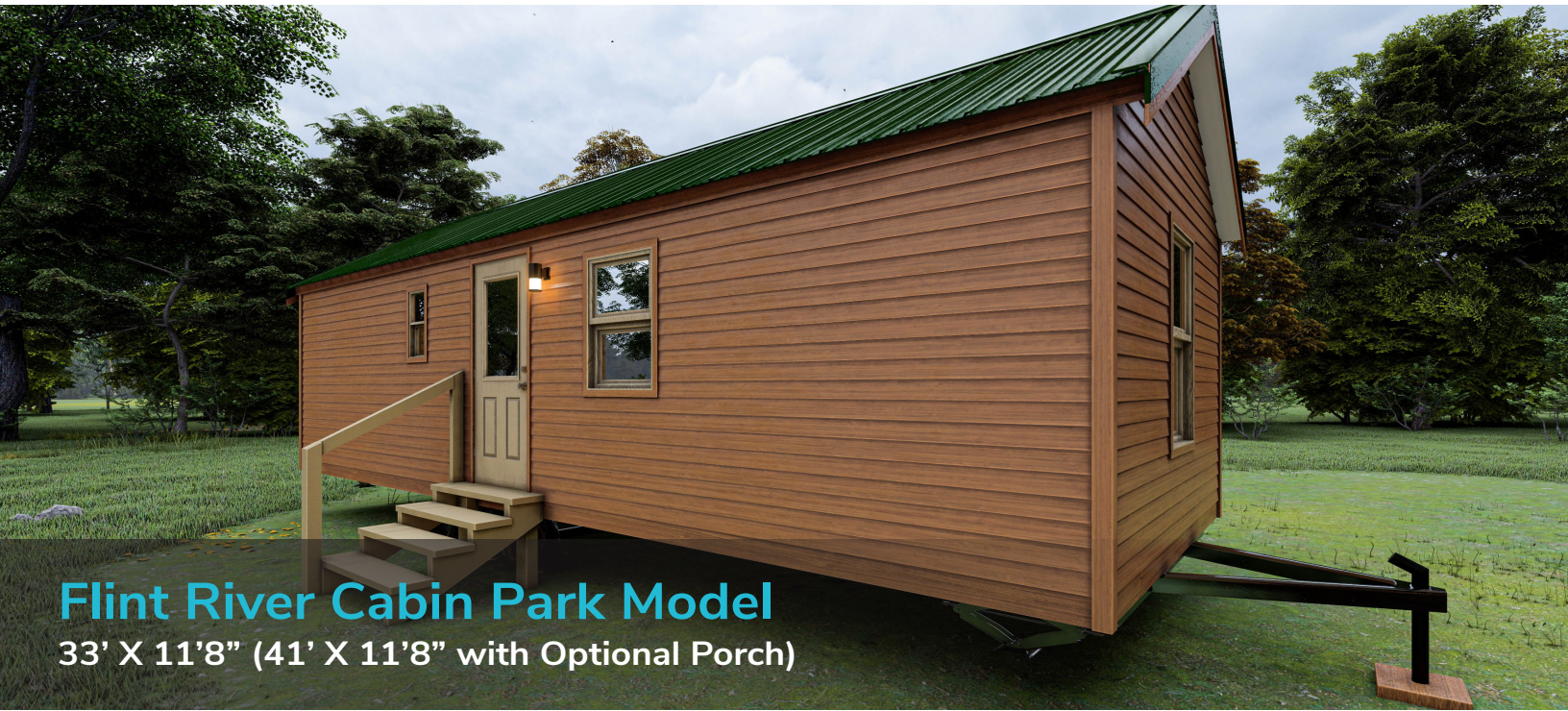
Flint River Cabin Park Model 33' X 11'8" (41' X 11'8" with Optional Porch)