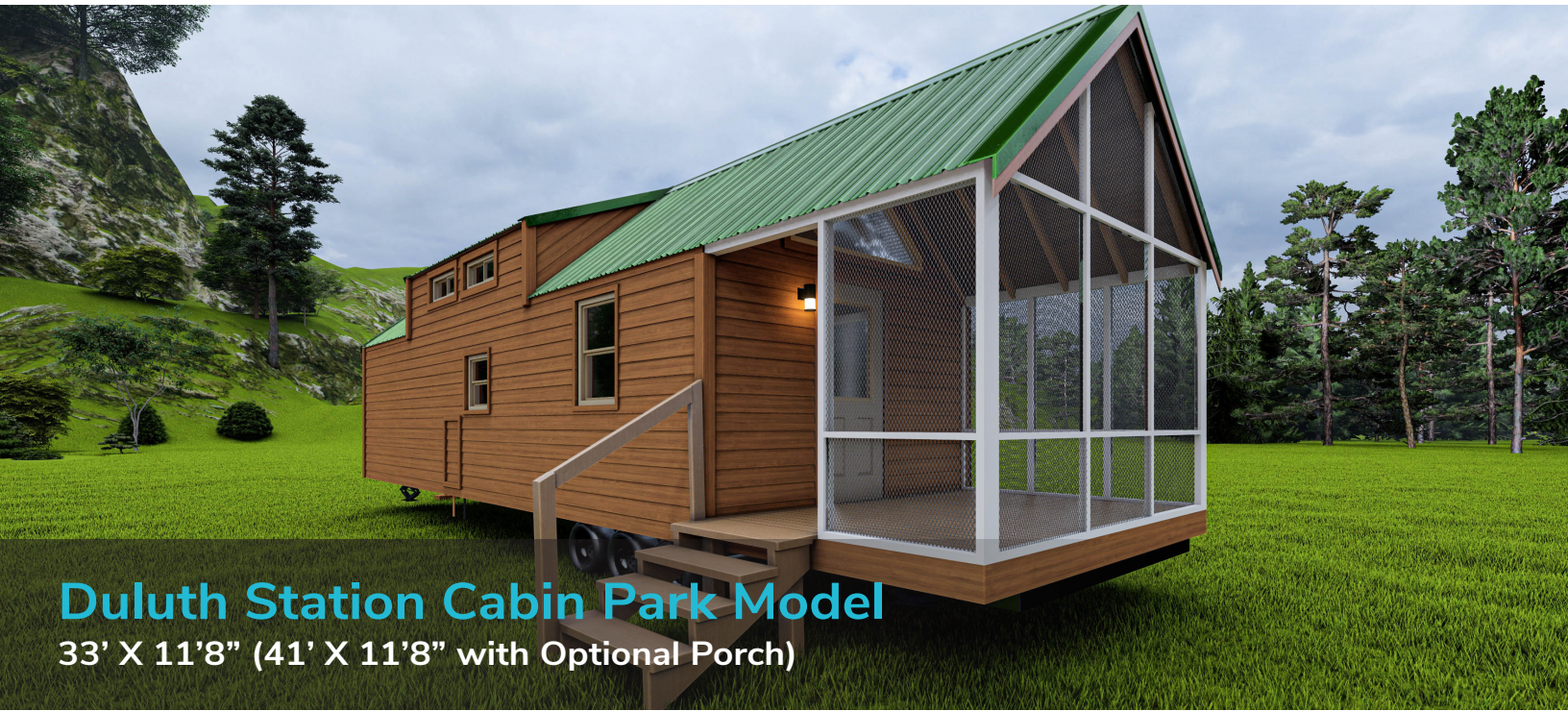
Duluth Station Cabin Park Model 33' X 11'8" (41' X 11'8" with Optional Porch)