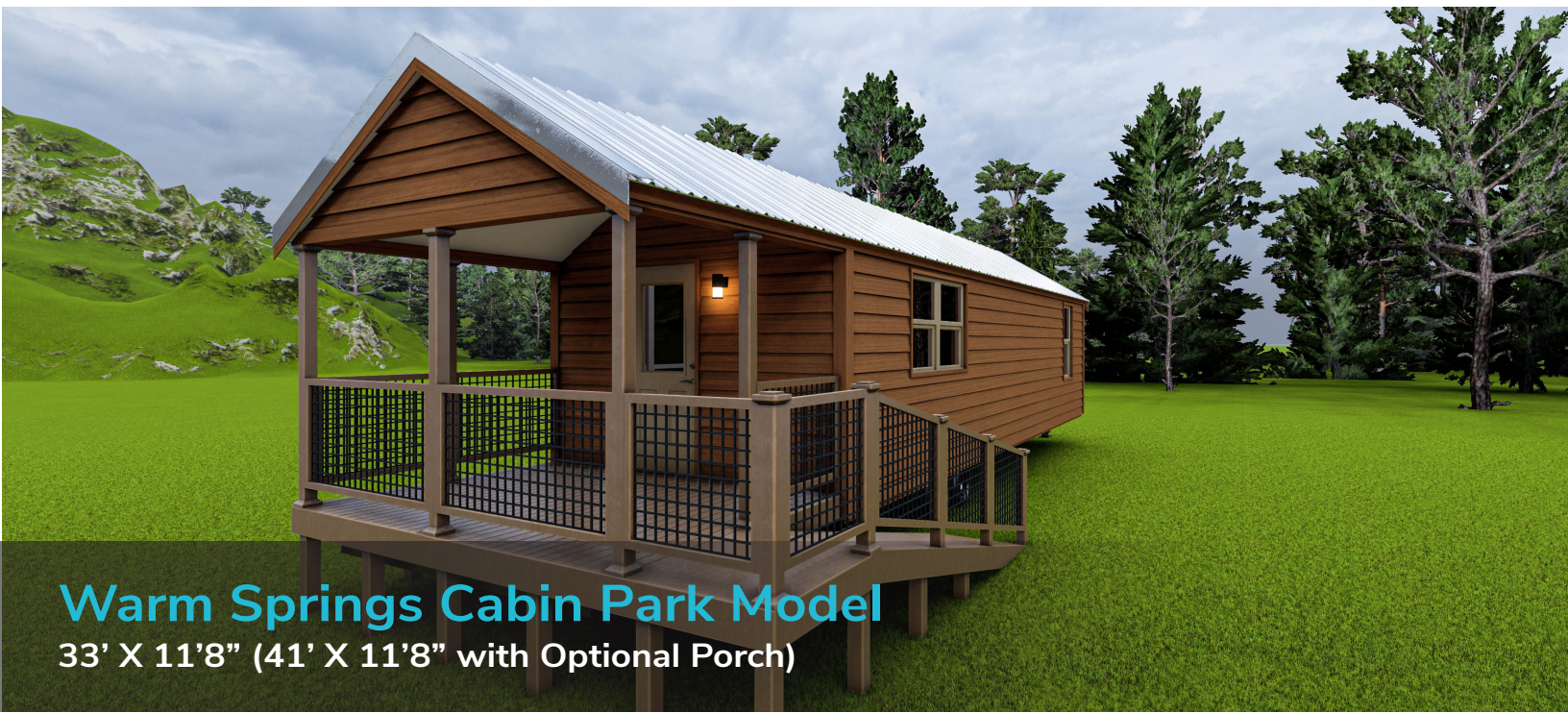
Warm Springs Cabin Park Model 33' X 11'8" (41' X 11'8" with Optional Porch)