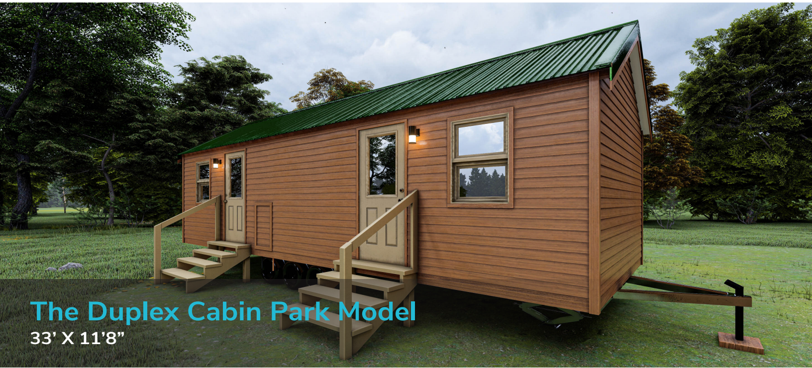
The Duplex Cabin Park Model 33' X 11'8"