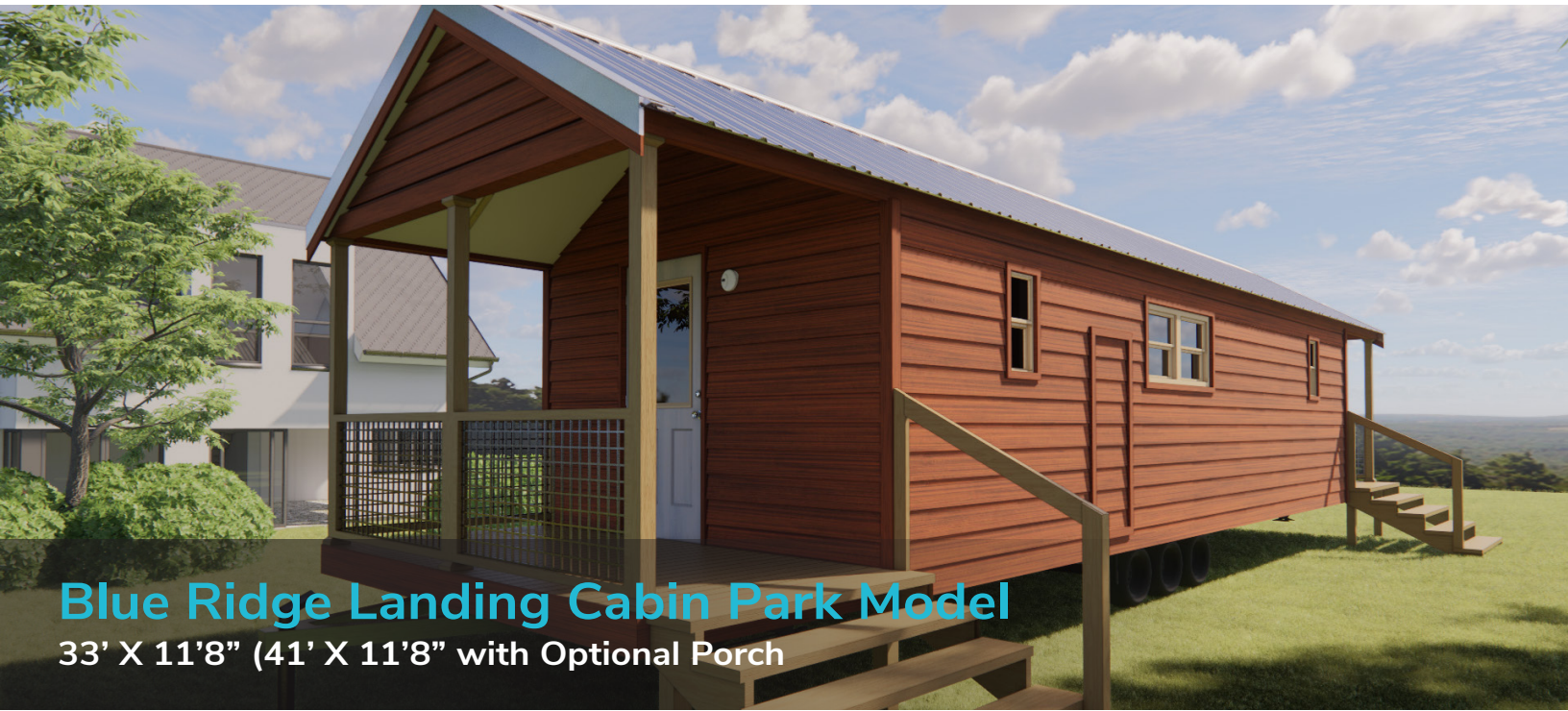
Blue Ridge Landing Cabin Park Model 33' X 11'8" (41' X 11'8" with Optional Porch)