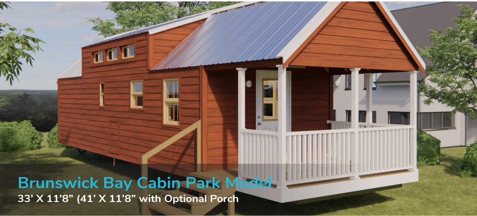
Brunswick Bay Cabin Park Model 33' X 11'8" (41' X 11'8" with Optional Porch)