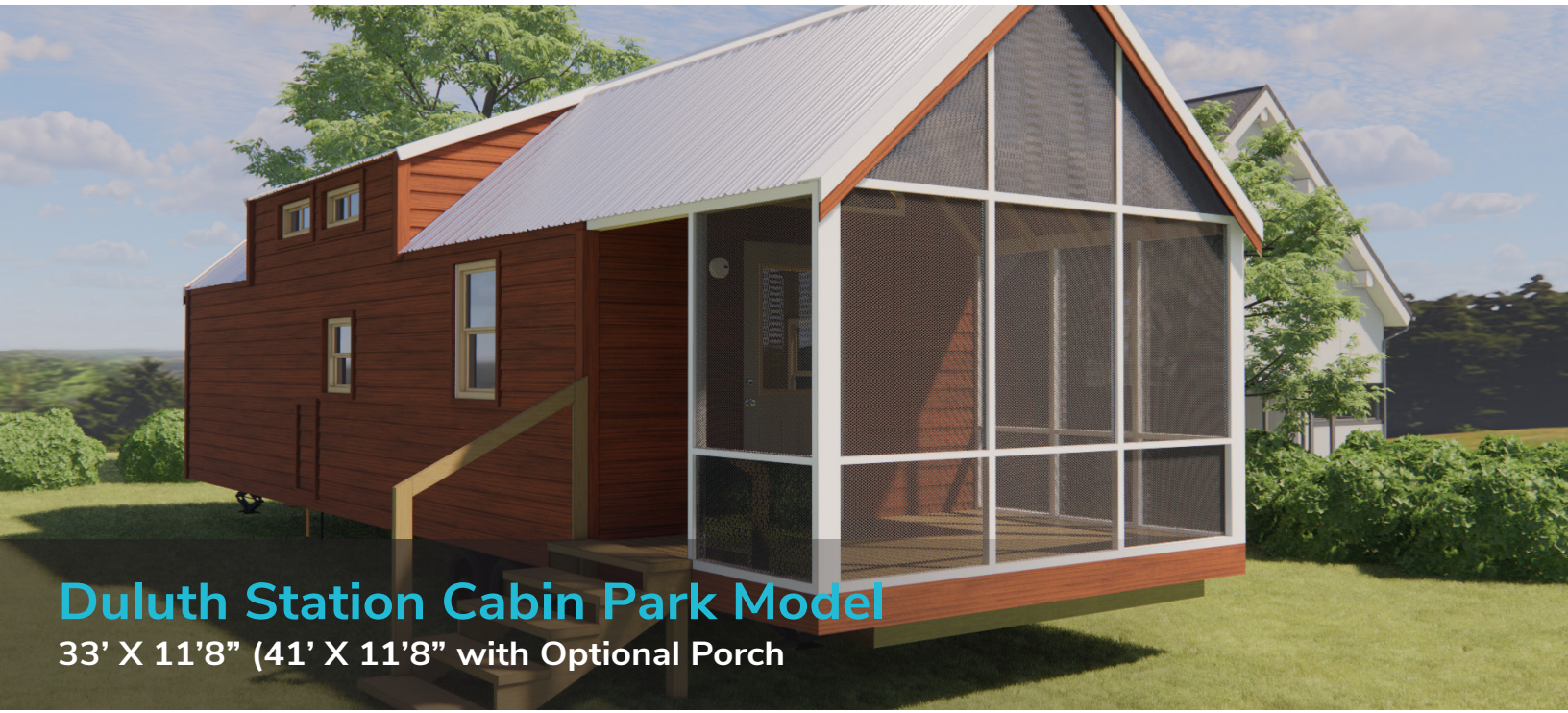
Duluth Station Cabin Park Model 33' X 11'8" (41' X 11'8" with Optional Porch)