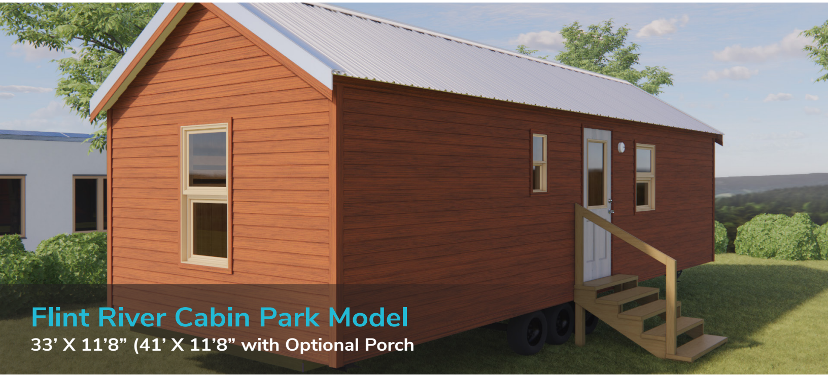
Flint River Cabin Park Model 33' X 11'8" (41' X 11'8" with Optional Porch)