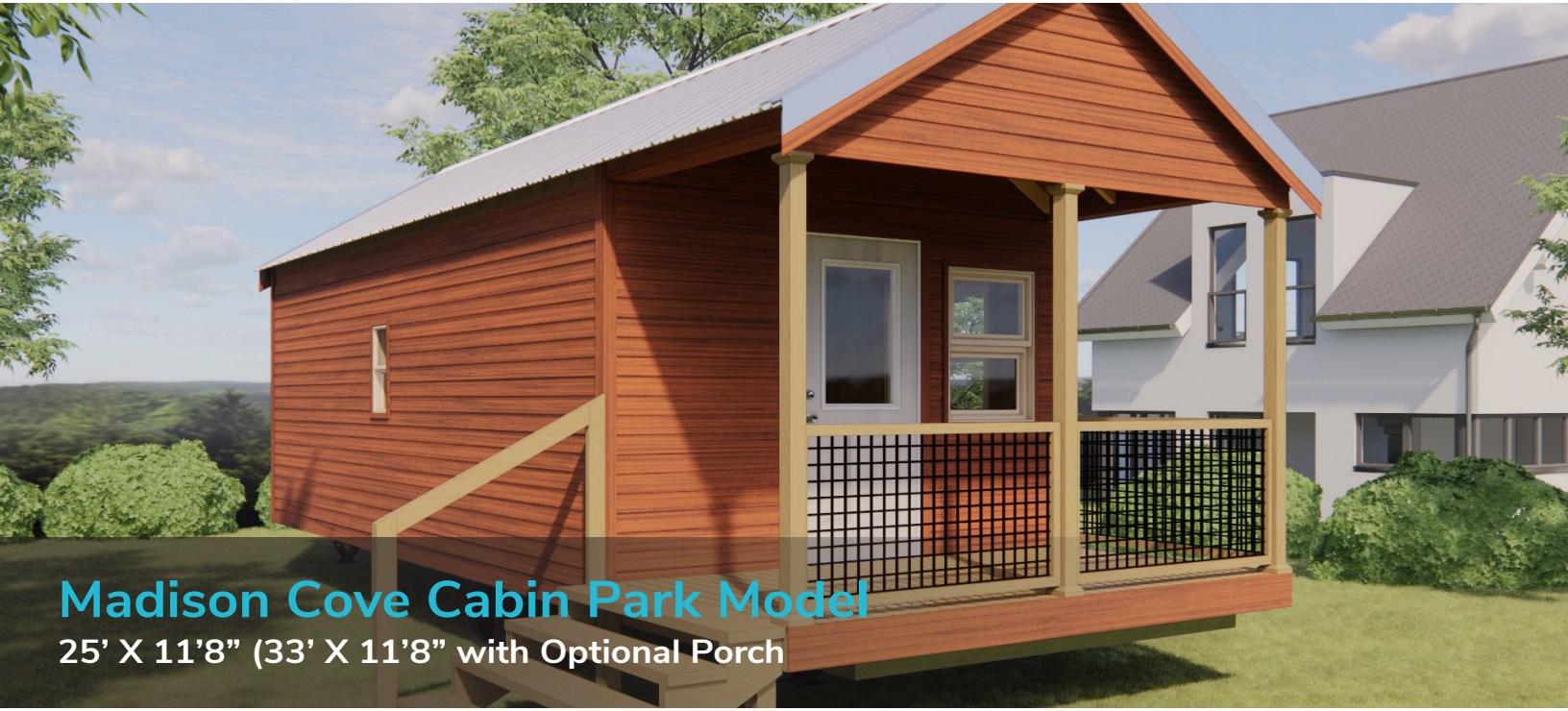
Madison Cove Cabin Park Model 25' X 11'8" (33' X 11'8" with Optional Porch)