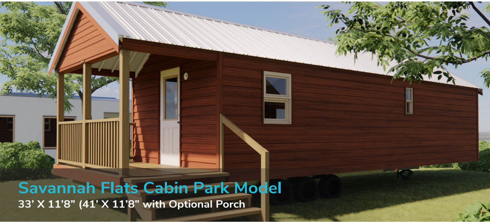
Savannah Flats Cabin Park Model 33' X 11'8" (41' X 11'8" with Optional Porch)