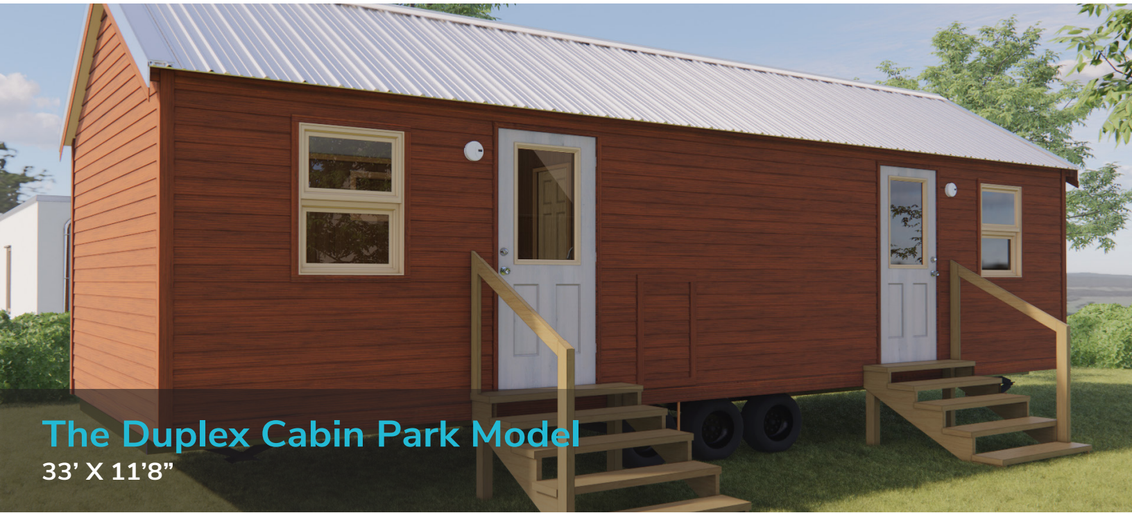
The Duplex Cabin Park Model 33' X 11'8"