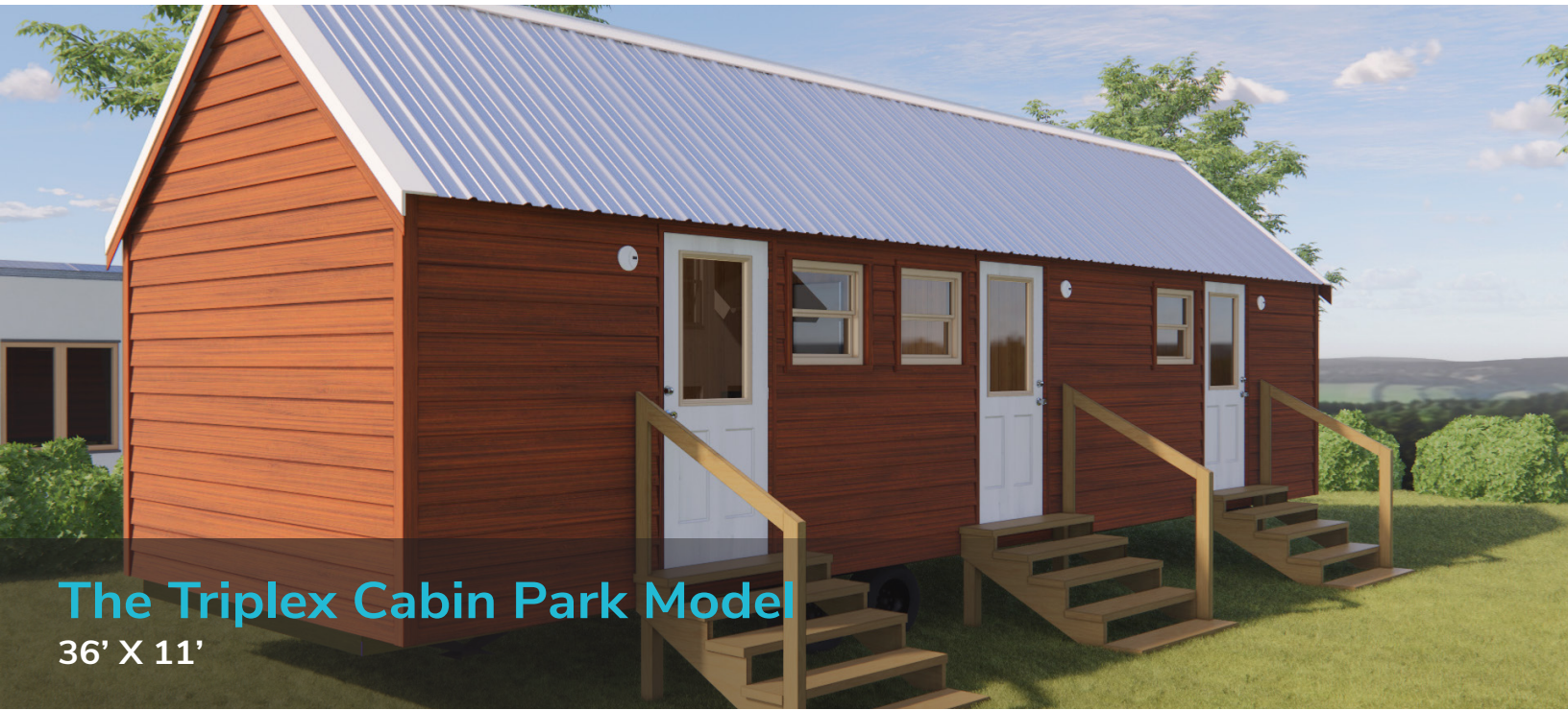
The Triplex Cabin Park Model 36' X 11'