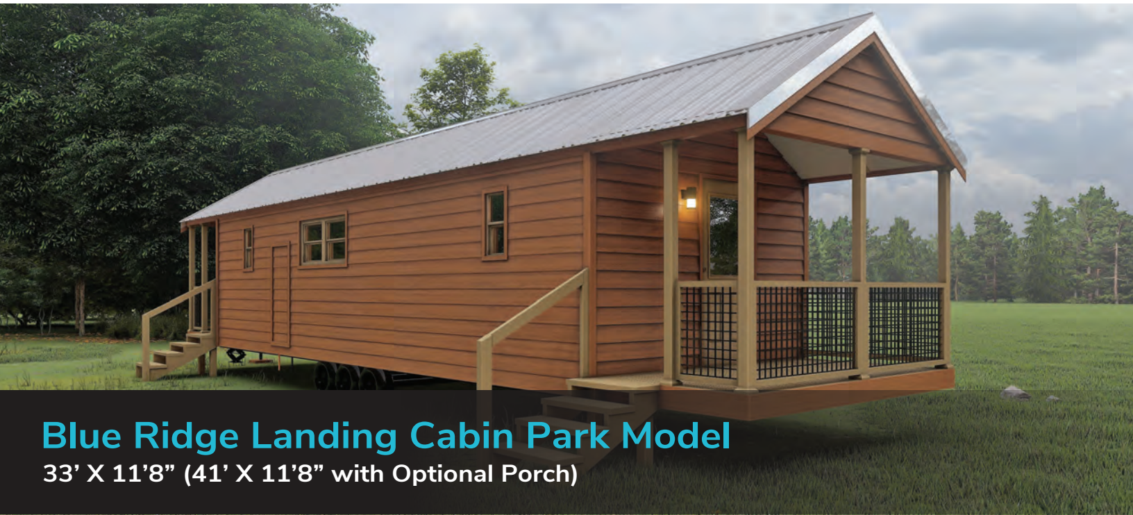
Blue Ridge Landing Cabin Park Model 33' X 11'8" (41' X 11'8" with Optional Porch)