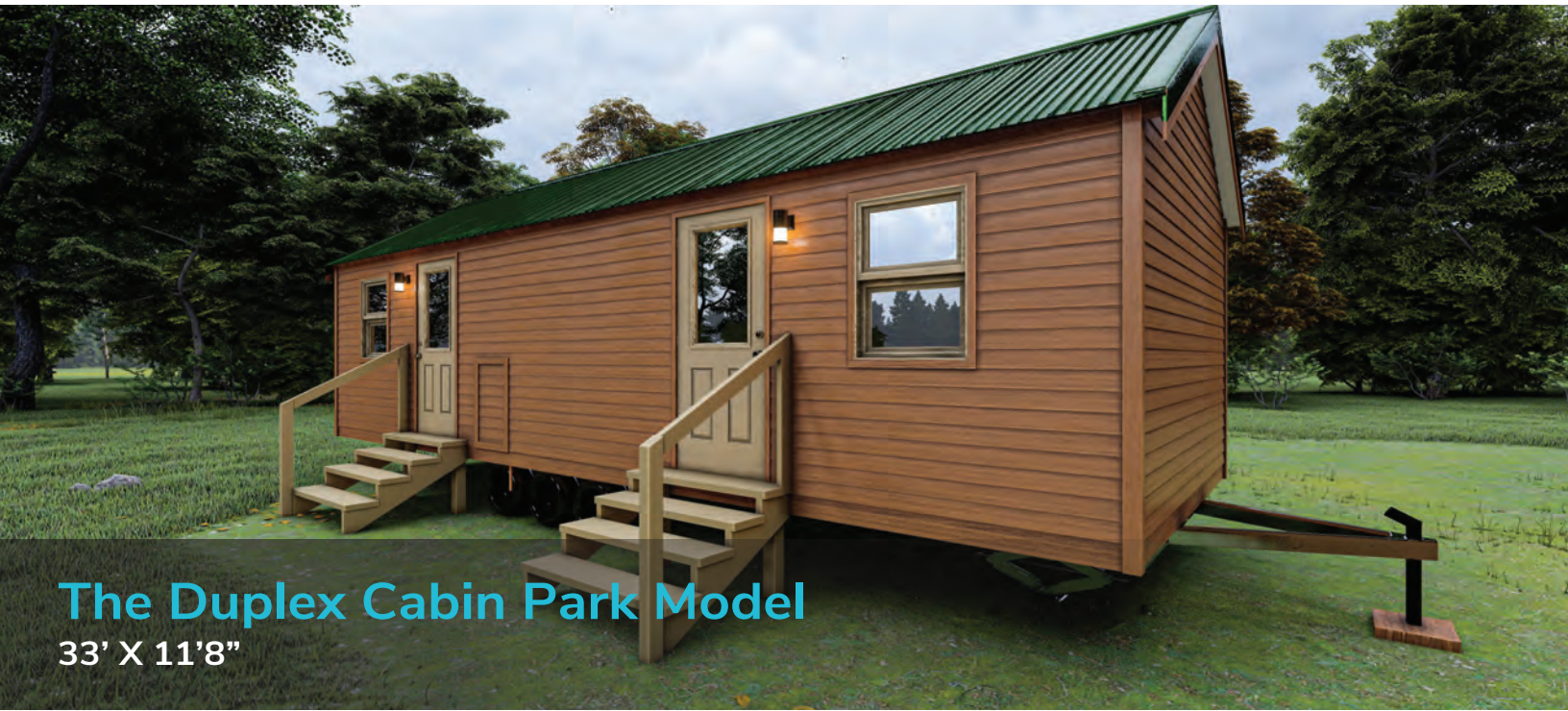
The Duplex Cabin Park Model 33' X 11'8"