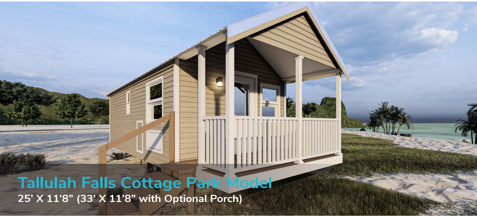
Tallulah Falls Cottage Park Model 25' X 11'8" (33' X 11'8" with Optional Porch)