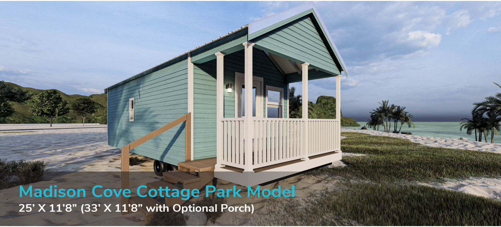
Madison Cove Cottage Park Model 25' X 11'8" (33' X 11'8" with Optional Porch)