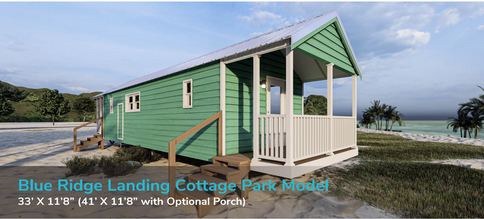
Blue Ridge Landing Cottage Park Model 33' X 11'8" (41' X 11'8" with Optional Porch)