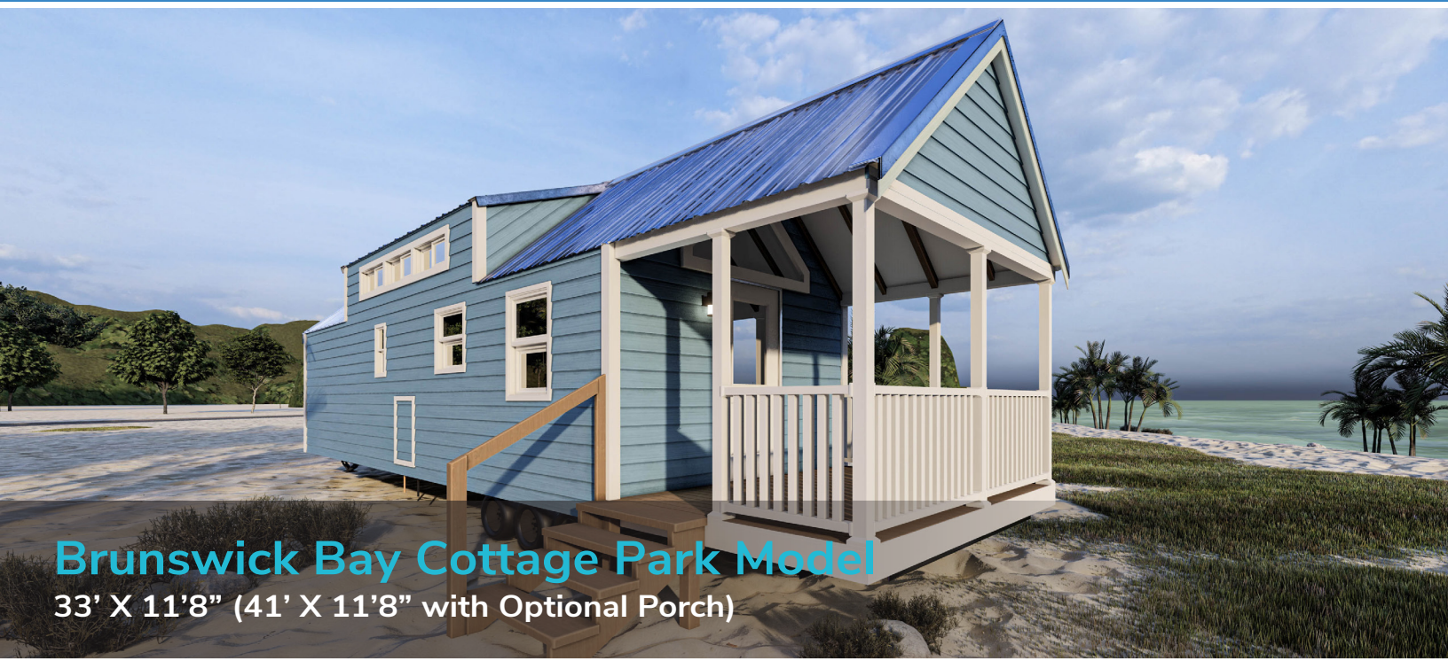
Brunswick Bay Cottage Park Model 33' X 11'8" (41' X 11'8" with Optional Porch)