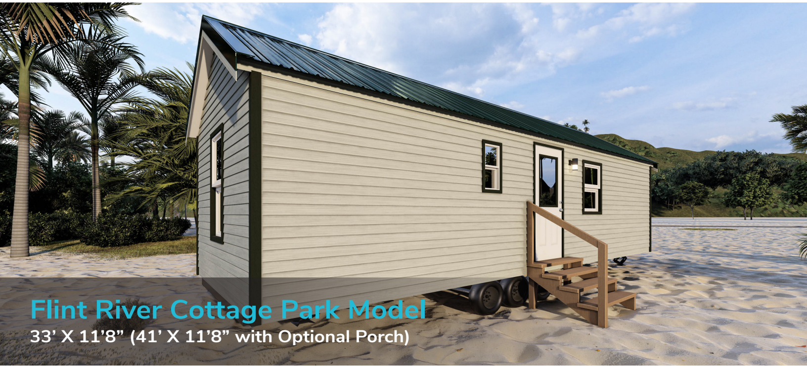
Flint River Cottage Park Model 33' X 11'8" (41' X 11'8" with Optional Porch)