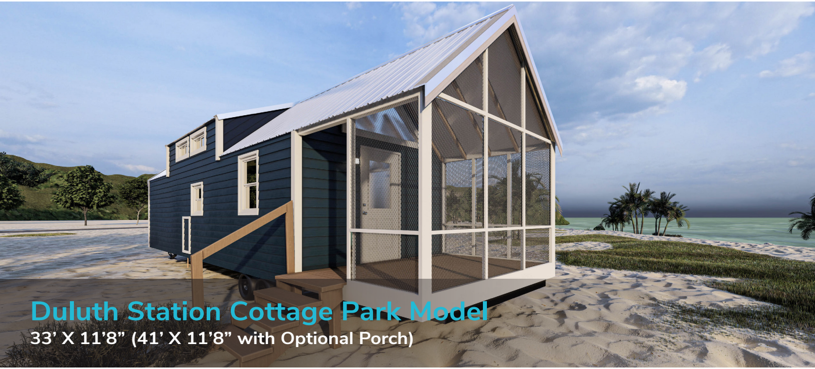
Duluth Station Cottage Park Model 33' X 11'8" (41' X 11'8" with Optional Porch)