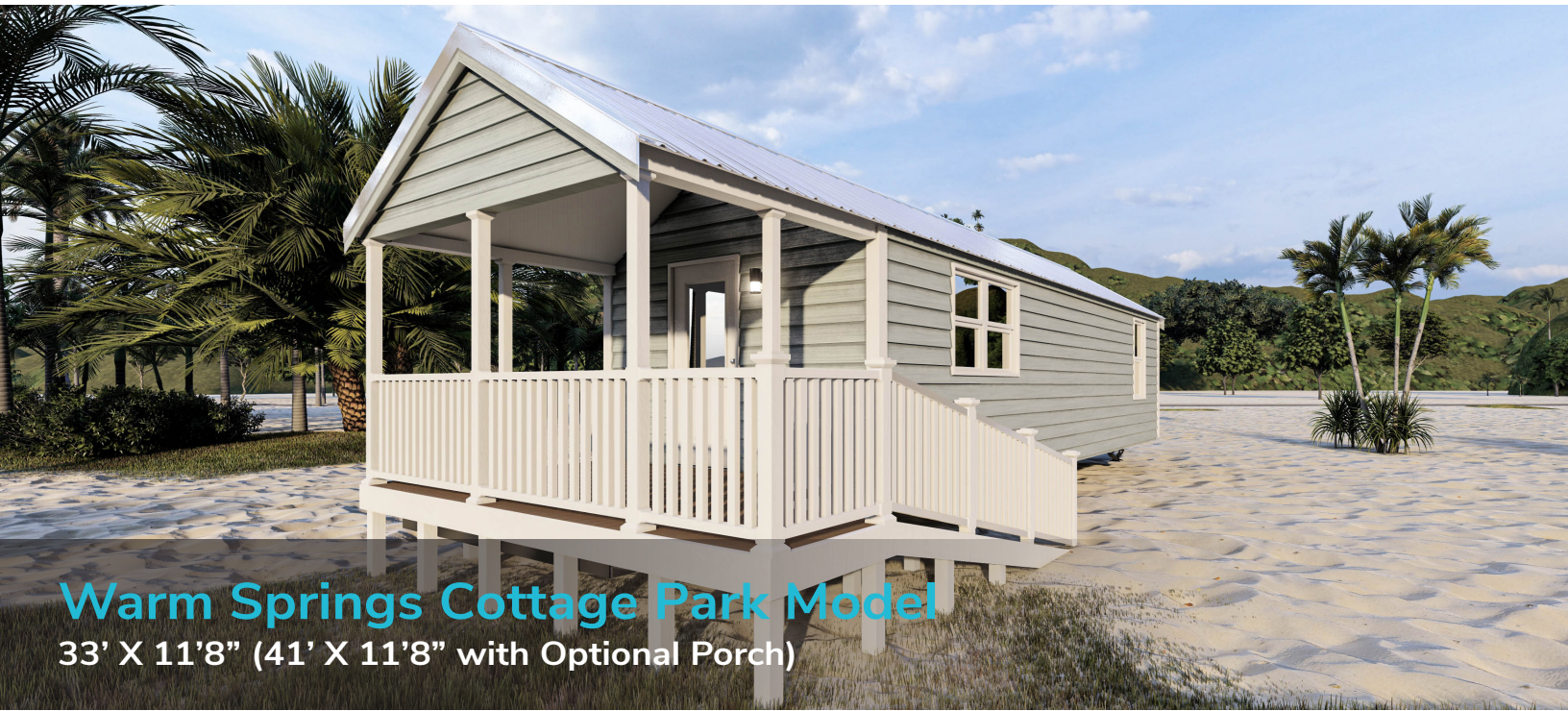
Warm Springs Cottage Park Model 33' X 11'8" (41' X 11'8" with Optional Porch)