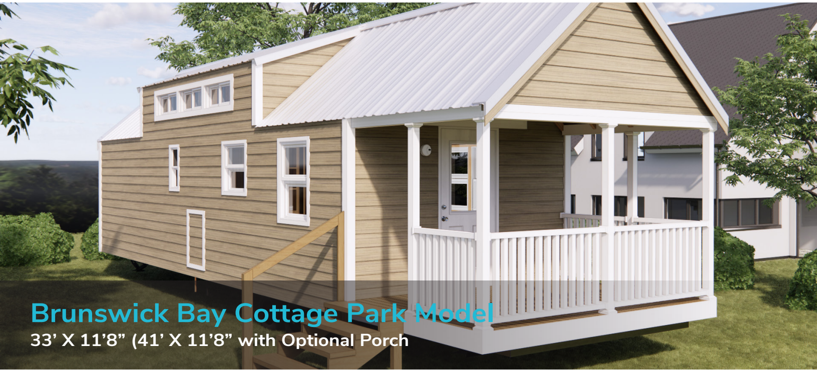
Brunswick Bay Cottage Park Model 33' X 11'8" (41' X 11'8" with Optional Porch)