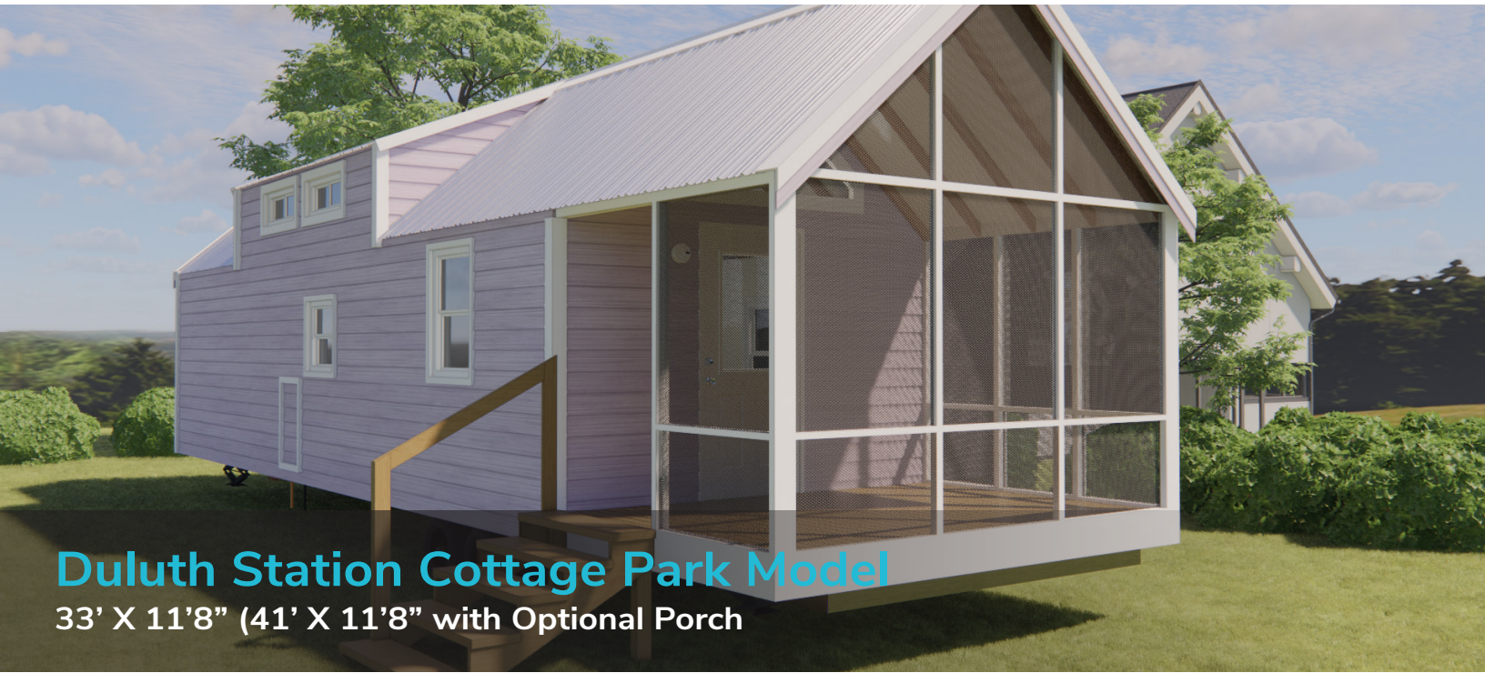
Duluth Station Cottage Park Model 33' X 11'8" (41' X 11'8" with Optional Porch)