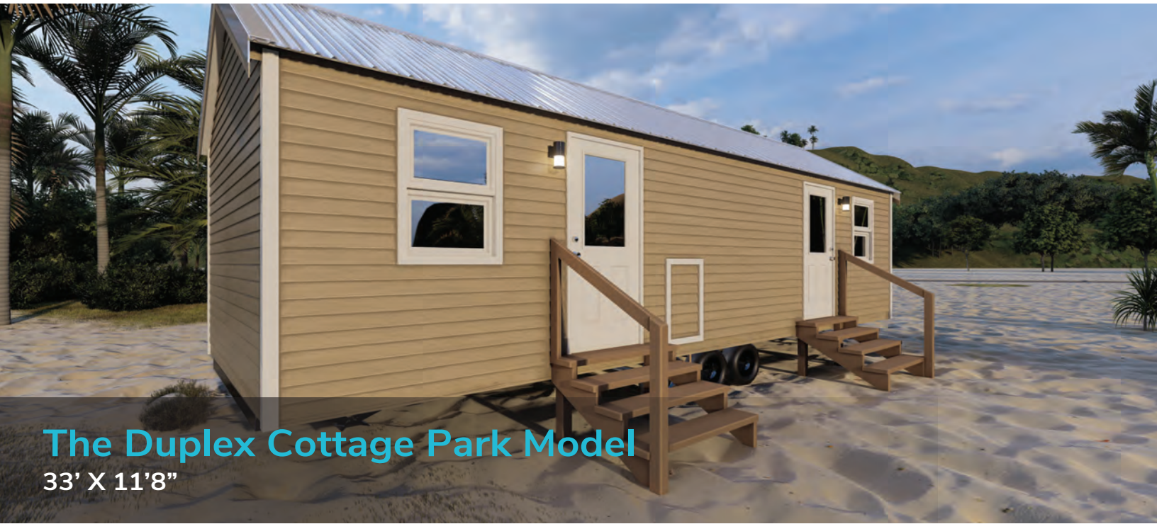
The Duplex Cottage Park Model 33' X 11'8"