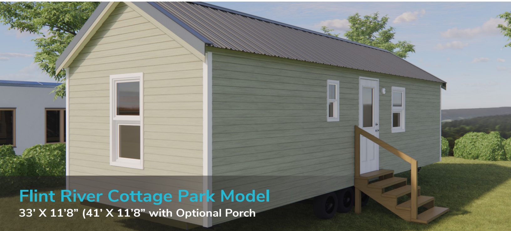
Flint River Cottage Park Model 33' X 11'8" (41' X 11'8" with Optional Porch)