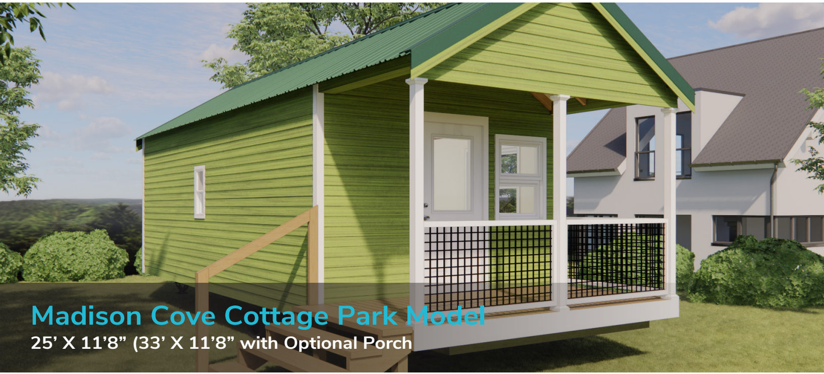
Madison Cove Cottage Park Model 25' X 11'8" (33' X 11'8" with Optional Porch)