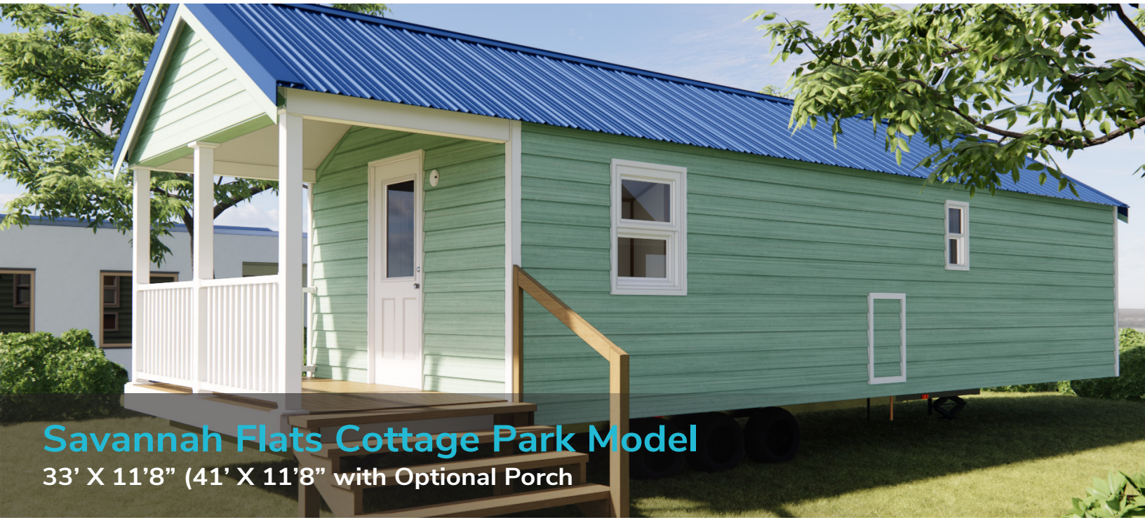
Savannah Flats Cottage Park Model 33' X 11'8" (41' X 11'8" with Optional Porch)