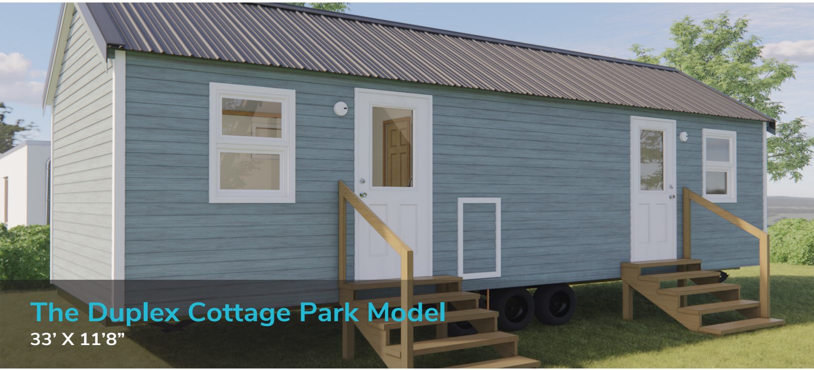
The Duplex Cottage Park Model 33' X 11'8"