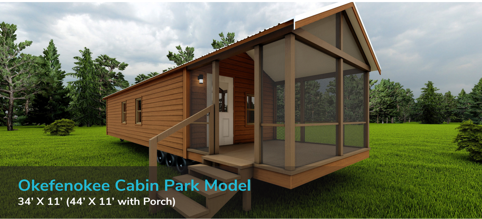
Okefenokee Cabin Park Model 34' X 11' (44' X 11' with Porch)