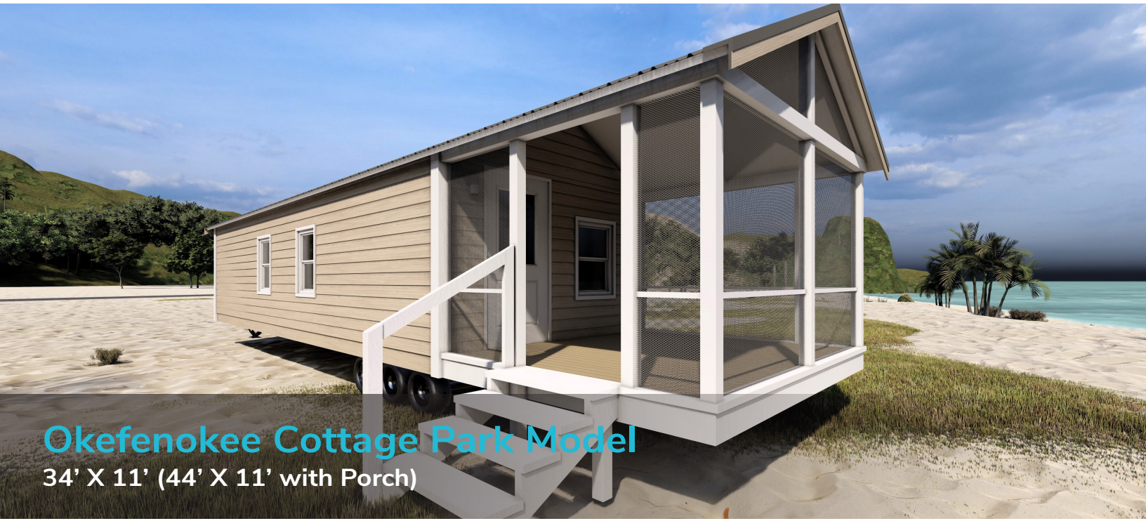
Okefenokee Cottage Park Model 34' X 11' (44' X 11' with Porch)