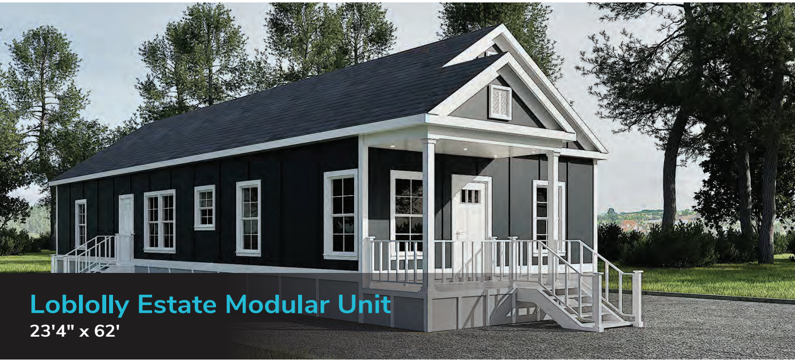
Loblolly Estate Modular Unit 23'4" x 62'